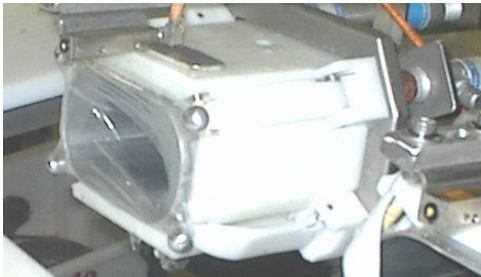
Air removal inside the packaging chamber