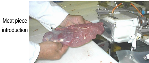
Meat piece introduction